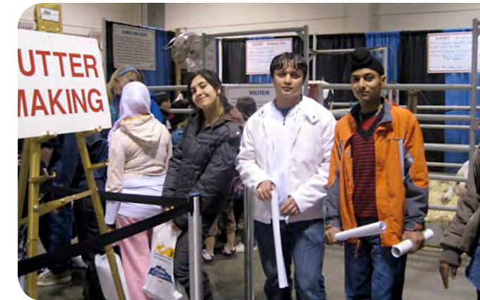
High school L.E.A.D. students on a field trip to learn about Alberta agriculture.

www.cbe.ab.ca/registration/fees-and-waivers/Pages/default.aspx