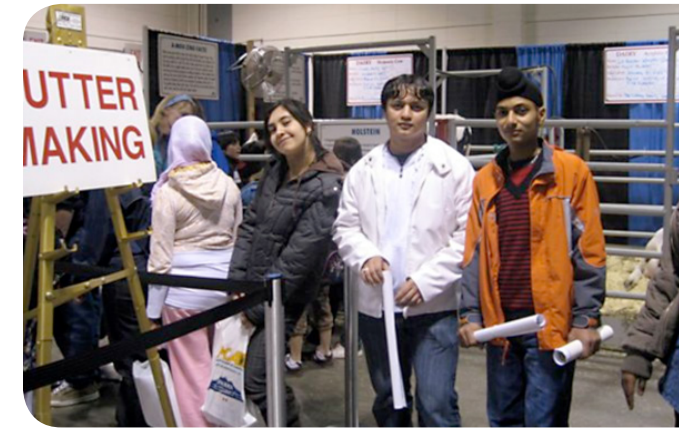
High school L.E.A.D. students on a field trip to learn about Alberta agriculture.

www.cbe.ab.ca/registration/fees-and-waivers/Pages/default.aspx