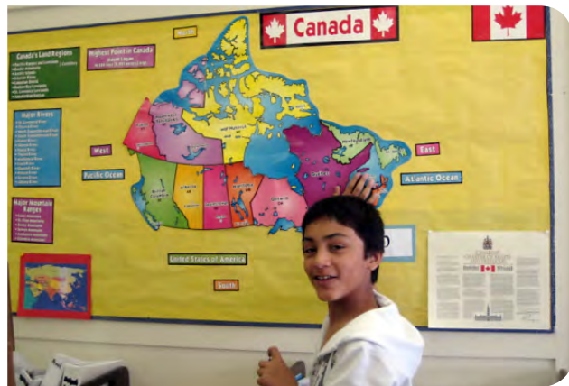
Learning about Canada.