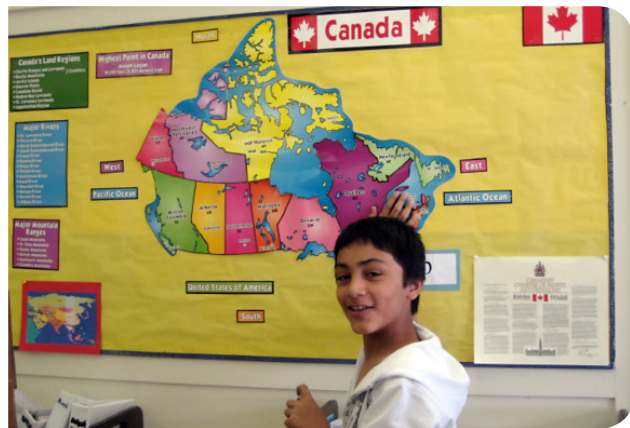
Learning about Canada.