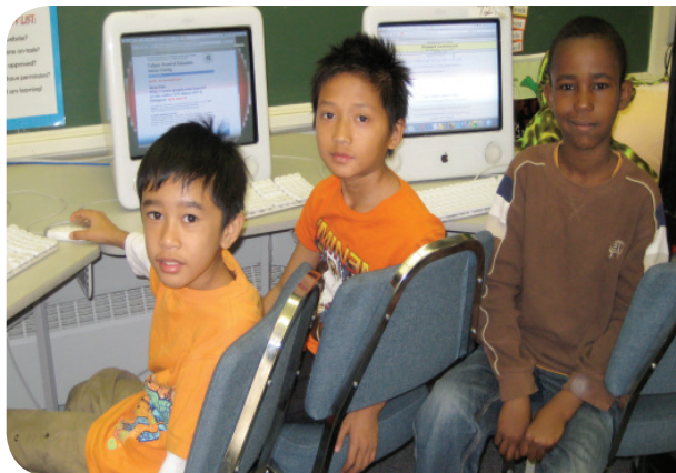
Students learning computer skills.