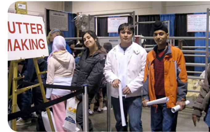
High school L.E.A.D. students on a field trip to learn about Alberta agriculture.

www.cbe.ab.ca/registration/fees-and-waivers/Pages/default.aspx