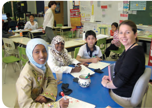
A guided reading lesson with the teacher.