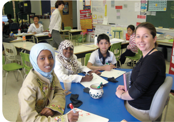
A guided reading lesson with the teacher.