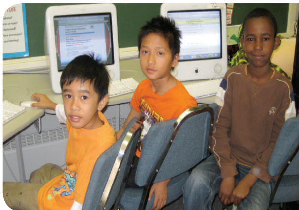
Students learning computer skills.