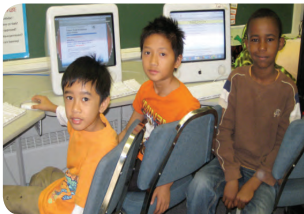
Students learning computer skills.