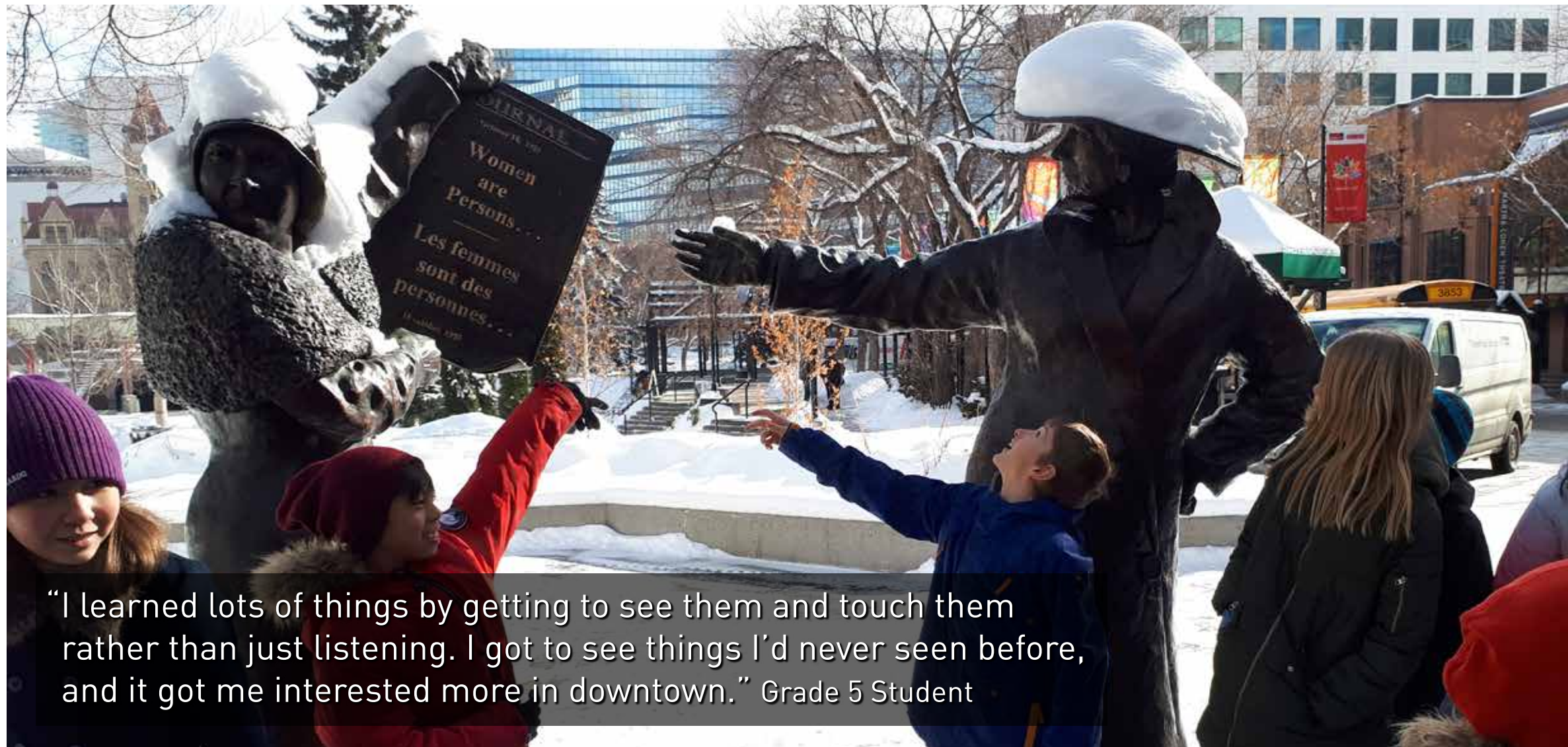
"I learned lots of things by getting to see them and touch them rather than just listening. I got to see things I'd never seen before, and it got me interested more in downtown." Grade 5 Student