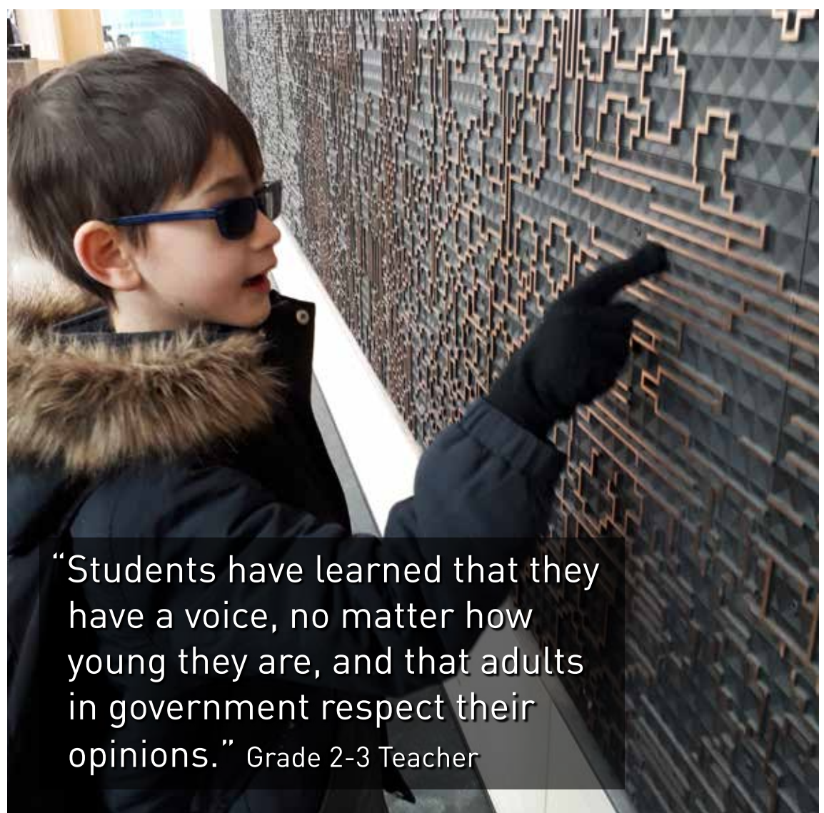
"Students have learned that they have a voice, no matter how young they are, and that adults in government respect their opinions." Grade 2-3 Teacher