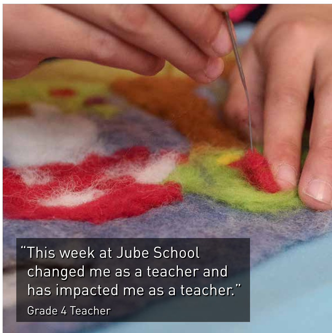
"This week at Jube School changed me as a teacher and has impacted me as a teacher." Grade 4 Teacher