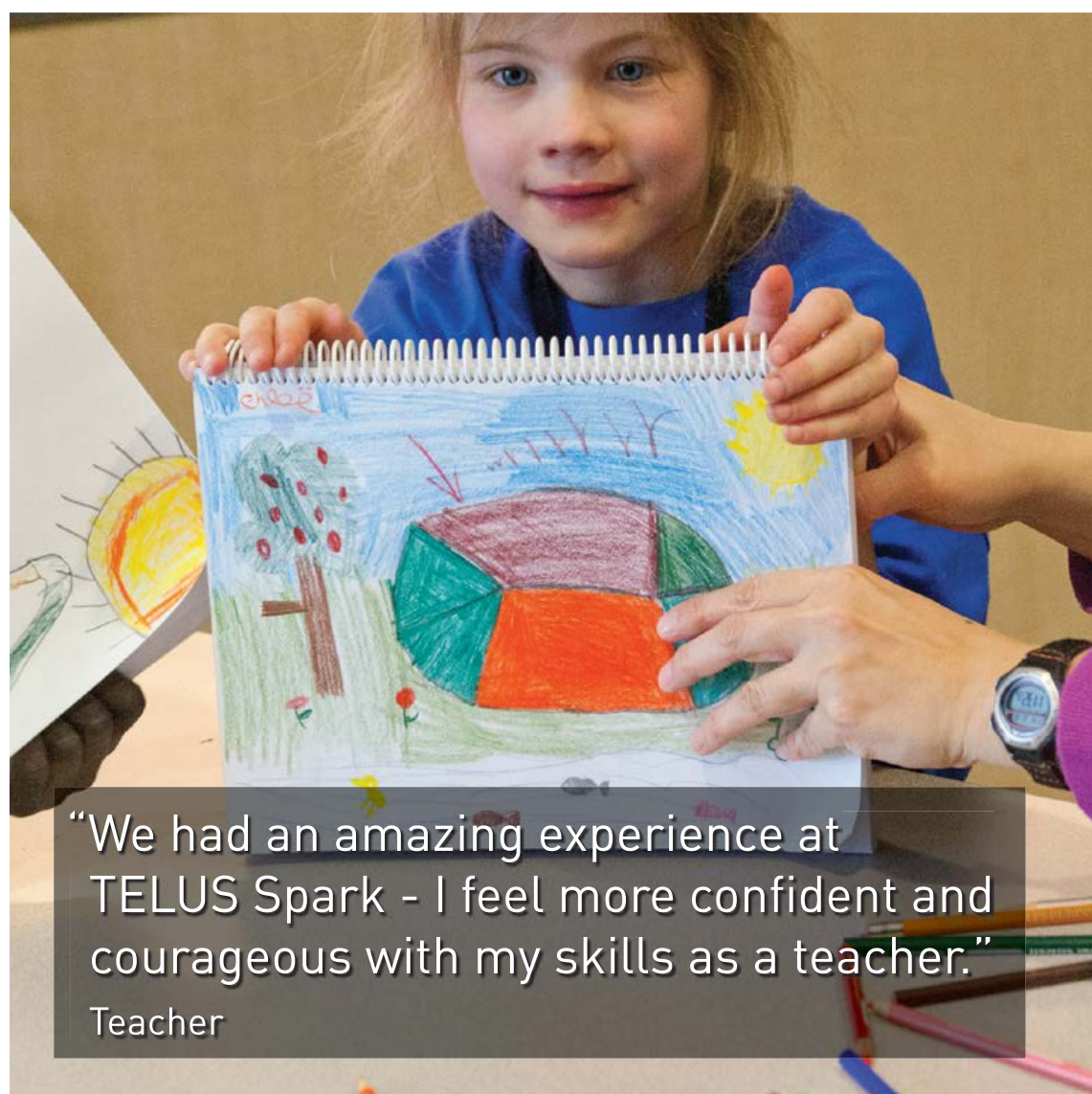
"We had an amazing experience at TELUS Spark - I feel more confident and courageous with my skills as a teacher." Teacher