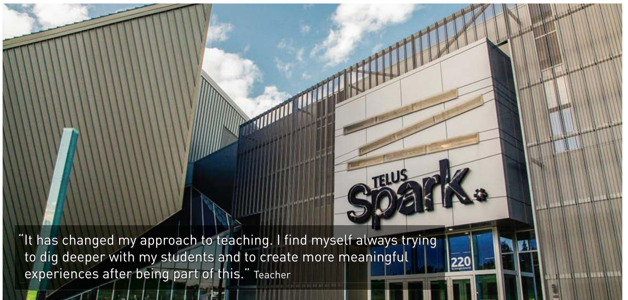
"It has changed my approach to teaching. I find myself always trying to dig deeper with my students and to create more meaningful experiences after being part of this." Teacher