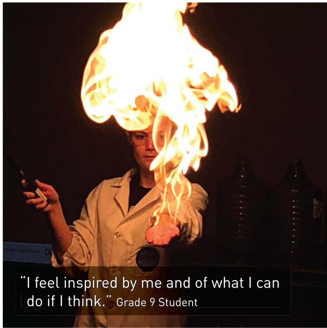
"I feel inspired by me and of what I can do if I think." Grade 9 Student